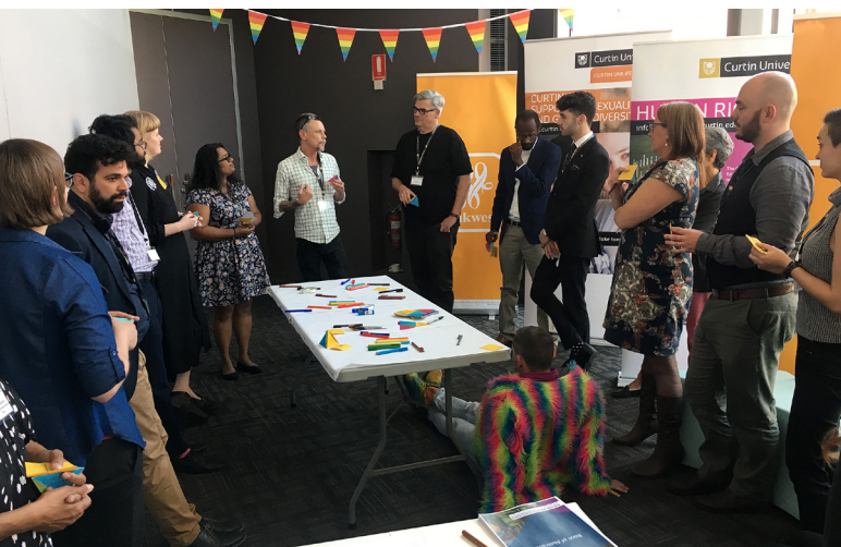
Concurrent Workshop Session 13, Building the Future of the Ally Network