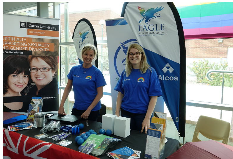
Conference Rainbow Sponsors, Alcoa of Australia