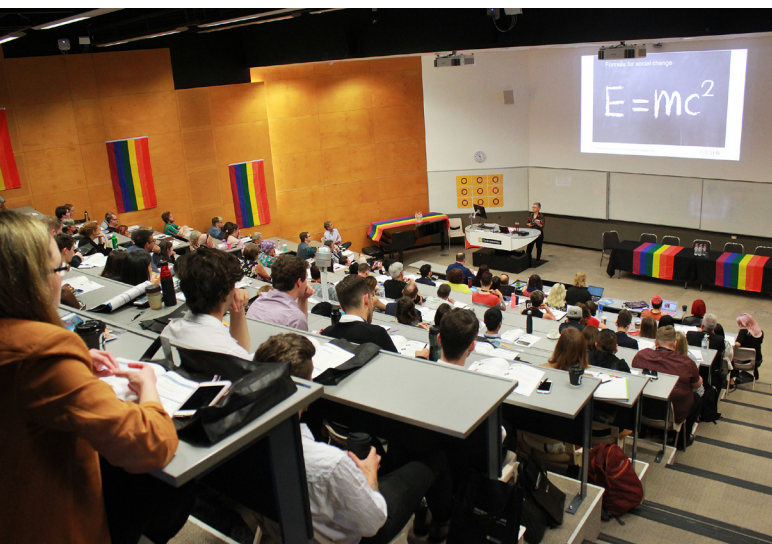
June Lowe, Plenary 1 speaker