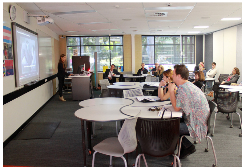
Concurrent Panel sessions, day 1