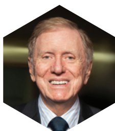
The Honourable Michael Kirby AC CMG Patron, Curtin Centre for Human Rights Education

As universities, we play a critical role in ensuring that our students are educated in an environment where diversity and inclusion are celebrated and supported. Our well-established Ally networks ensure that we are successful in this mission and, in doing so, help to build a stronger, fairer and more cohesive society for us all.